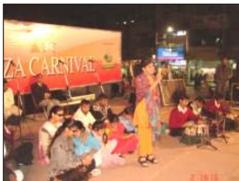
Glimpses of Special Children mesmerizing at Plaza Carnival

In fact the entire-evening revealed that courage, conviction and expert training with guidance can work miracles. The disabled children, some severely handicapped, cast a spell on audiences who witnessed the entire programme in wonder and amazement.