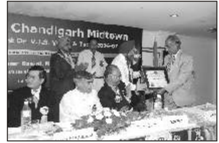
Club Charter changes hands