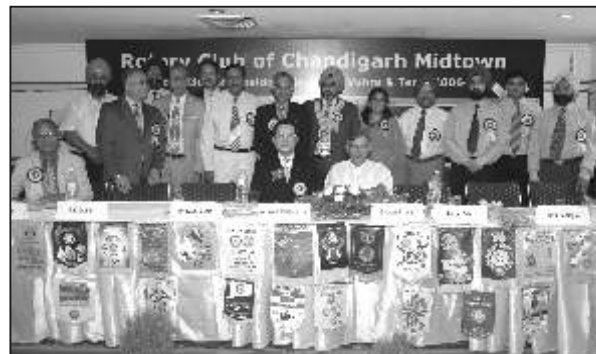
The Team to 'Lead The Way' in 2006-07