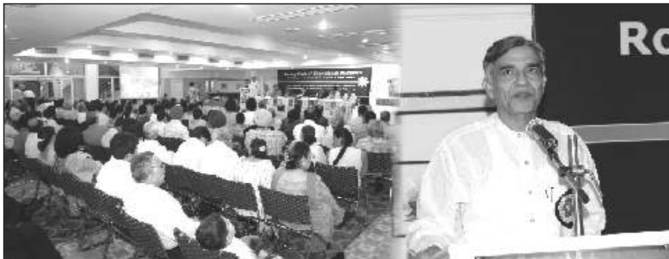
The audience giving a patient hearing to the Chief Guest