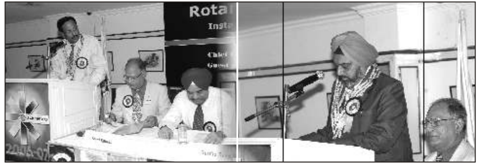
Outgoing President & Incoming President making their respective presentations