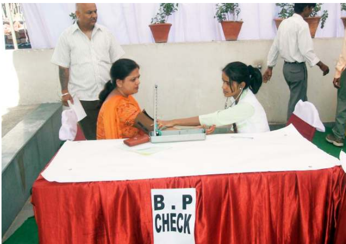
Blood Pressure Counter

“Teri Yaad mein ik ansoo, sau shikwon pe bhari hai Teri virha mein rona, yeh namaz hamri hai”