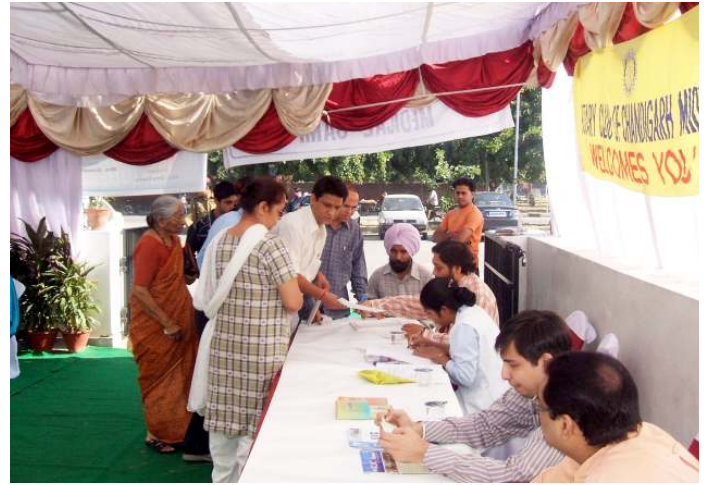
Registration & Reception at work