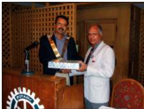
Memento for the Promoter