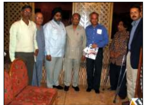
Members of the RCC with the Midtowners