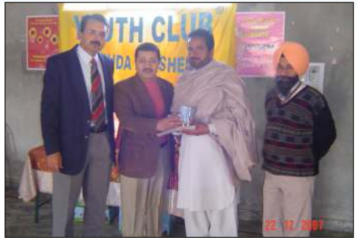
One Kg. Desi Ghee for the Donor