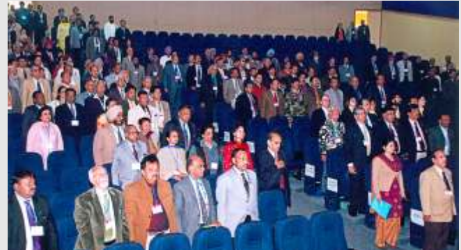
The National Anthem

Nostalgic glimpses from the Conference of Sharing - The District Conference RID 3080