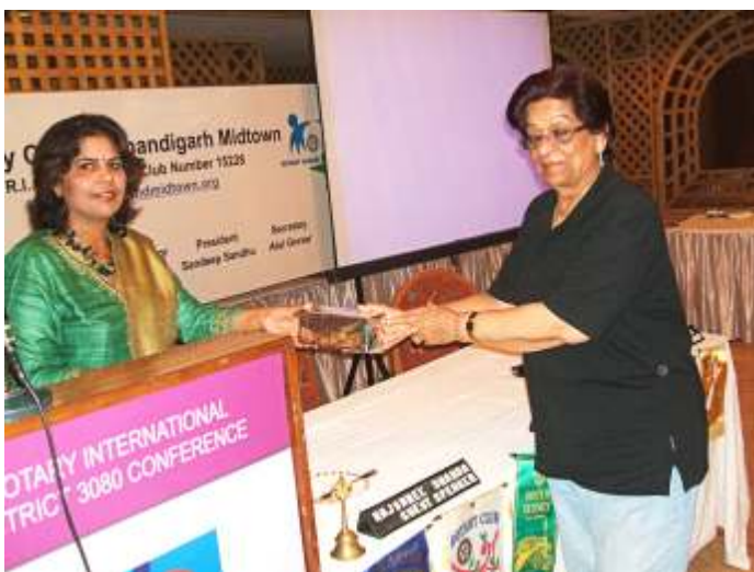
Memento for the Punctuality Draw Winner

manager, in a typical customer is always right fashion, explained that the food on the next table was a fast food order and that our food is a fine food order and hence time gap. This subsided the brother's anger and the tension of being discriminated disappeared. The