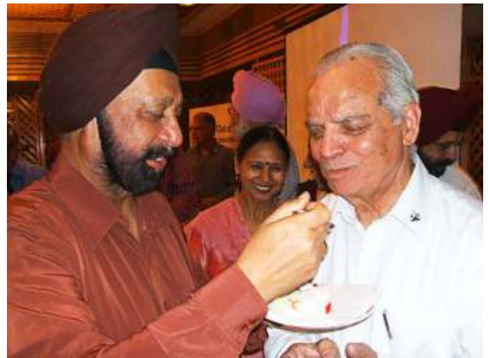
Happy Anniversary Bite