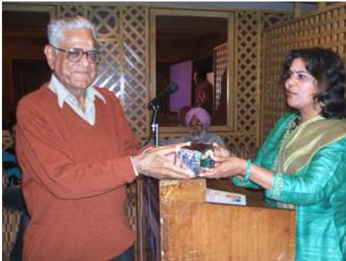
Gift for the Happy Birthday Boy