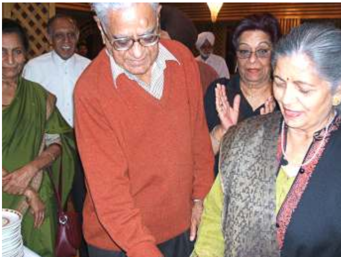
Happy Birthday Cake

She narrated an example of purposeful communications, right understanding, positive thinking, tolerance and forgiveness through an incident in a restaurant where the family had gone for a meal. Her brother ordered the food and waited for the service. In the meantime another group came occupied the table next to their table. Their order for the food was served but her brother and the family group were still waiting for their order of food. The brother got angry, called the waiter and protested against the delay. More time passed and still there was no sign of their food and the group on the next table was enjoying their food. So, the brother called the manager and asked the reasons for the delay. The