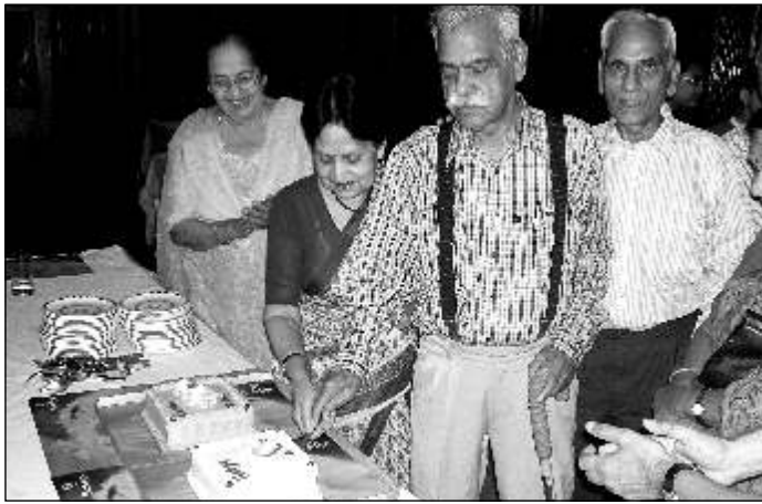
Happy Anniversary Cake