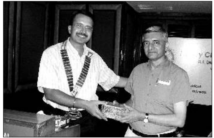
Memento for the Quiz Master