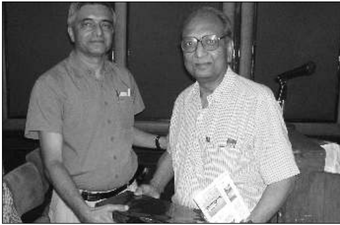
Gift for the punctuality draw winner