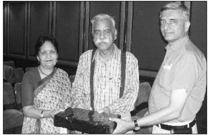
Gift for the Happy Anniversary Couple

The President also felt sorry for those Rotarians, Annes and Youngsters that missed such an interesting programme.