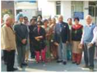
Rotarians and members of Inner Wheel Chandigarh Midtown