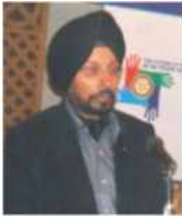
AG Charanjit Singh appreciates the work done by the 3 RCCs

crutches, cleanliness drive in village Rally of Panchkula, training disabled persons in computers, book binding, knitting, embroidery & tailoring, music & dance, fashion designing and beauty parlour. They have ambitious plans for future, for which they hope to get public support and