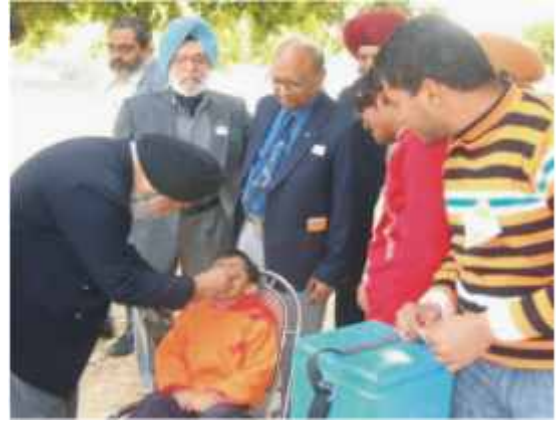
Pres. Gurdip Deep giving Polio drops to kids in Sec. 46, Chandigarh, to continue our fight against polio