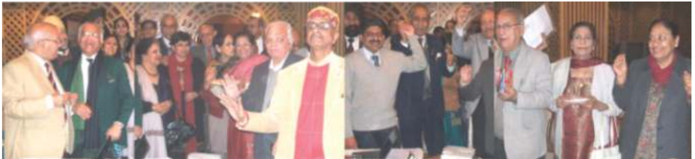
Rotarians and R'anns dance during Lohri celebrations

http://www.youtube.com/watch?v=F6Kmr1Wv_40&feature=player_embedded )