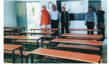
Rotary Club Saharanpur South supplied 85 benches to JP Inter college, Village Kota Saharanpur under 'Chandigarh Midtown Happy School Project'