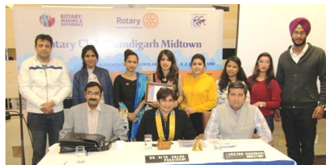
Office bearers of Rotaract Club of Samaritan with Rotarians of Chandigarh Midtown donated