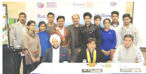
Office bearers of Rotaract Club of Le Corbusier with Rotarians of Chandigarh Midtown

Both the clubs donated $50 each towards the cause of Polio.