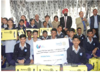
24 school bags presented to meritorious students