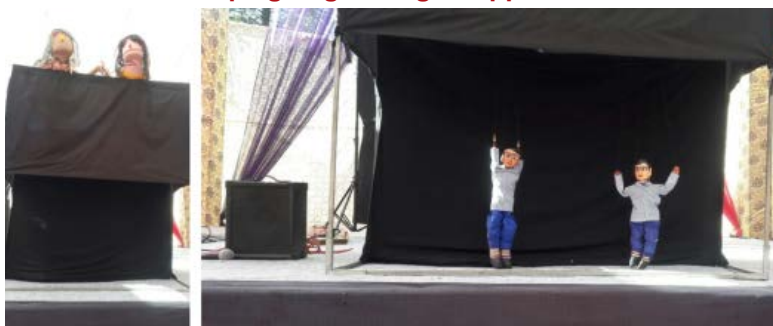
Puppet show for awareness on swachhta, water saving and drug abuse was organized by our club at District Conference on 17 March 2018