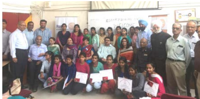
DG with students, Principal and Rotarians of Chandigarh Midtown