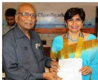
2 cheques by PP B.L. Ramsisaria