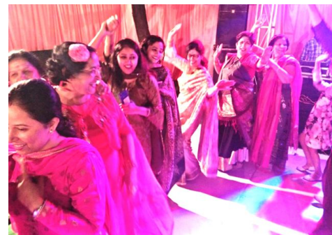
Celebrations with music and dance