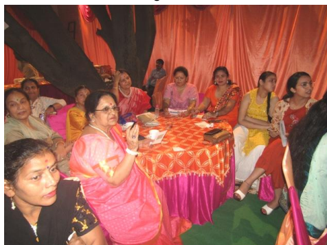
Enjoying the celebrations