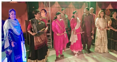
Dandiya by RFE members