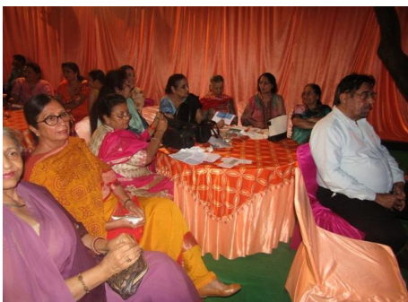
Enjoying the celebrations