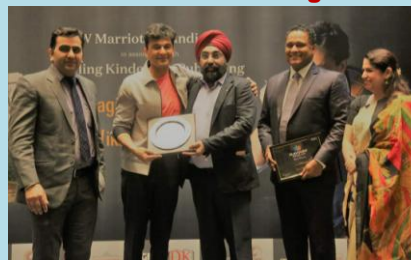
Presented award by first Michelin Star Indian Chef Vikas Khanna, for Best Hotel Management Institute from Leading Luxury Magazine Flavours