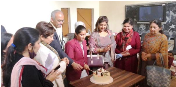
Celebrating 116 years of Rotary