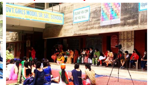
Independence Day Celebration at Govt. Girls Model Sr Sec School, Sector 20, Chandigarh