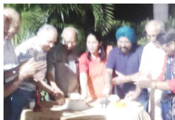
Cake cutting ceremony for birthdays and anniversary