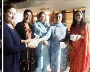
Rotary family enjoying the wonderful meeting. Click here for more photos on facebook