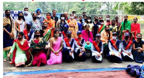
Independence Day Celebration and Interact Club Installation at GMGSSS Sector 20, Chandigarh