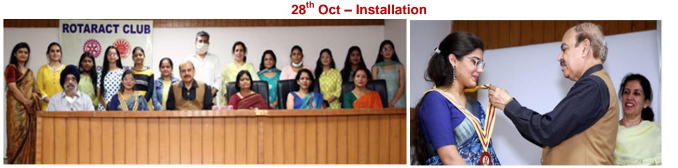
Installation of Rotract Club at Dev Samaj College Sector 45 Chandigarh