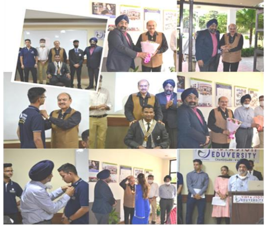
Installation of Rotract Club at Vidya Jyoti Institute