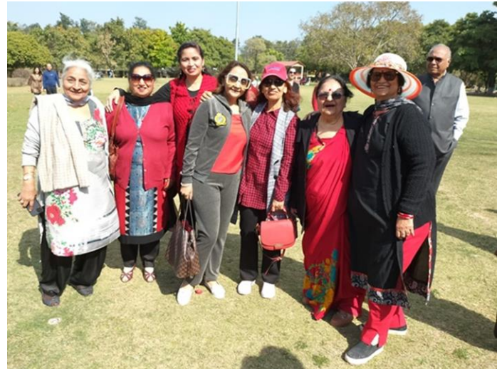
Love for Rotary