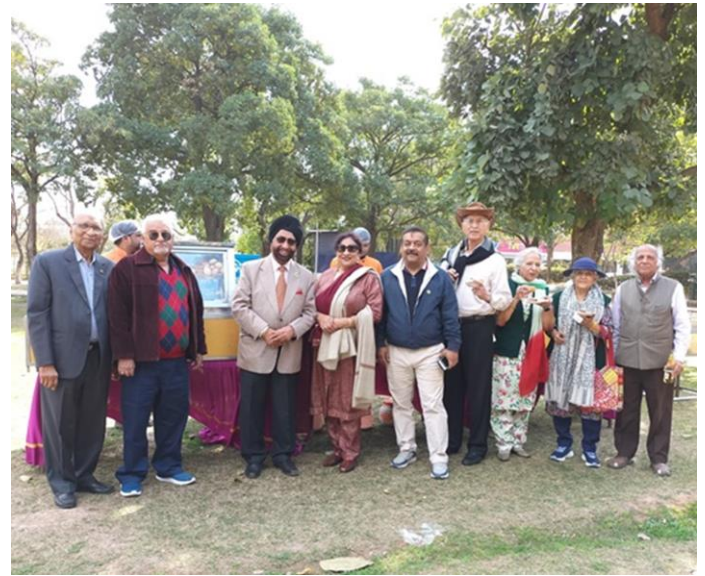
Stall for gol gappa and chat was one of the main attractions