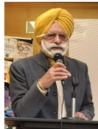
Blissful Invocation by PP RTPS Tulsi