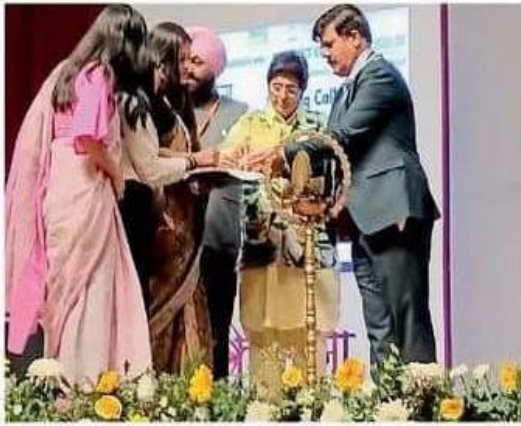
मुख्य अतिथि डॉ. किरण बेदी ने रोटेरियंस को संबोधित किया।