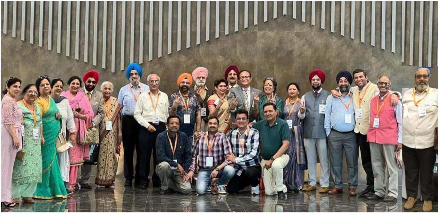
Chandigarh Midtowners at DisCon 2022-23