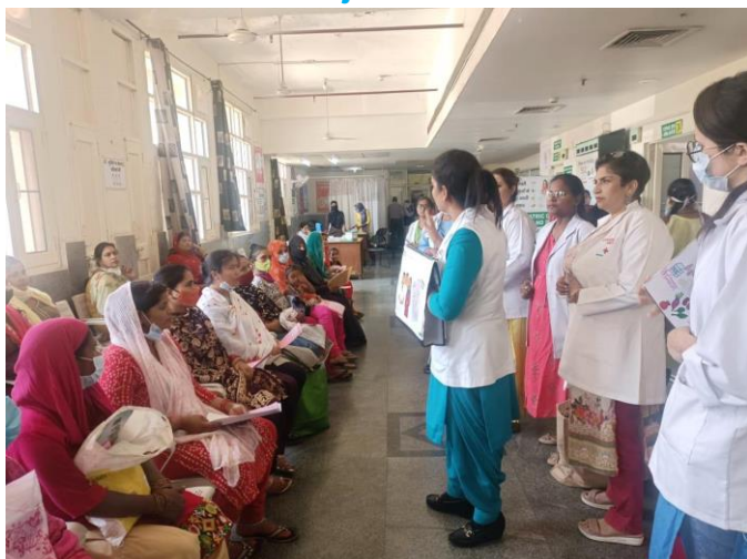
Nutrition supplements to would be mothers in the form of gud and chana