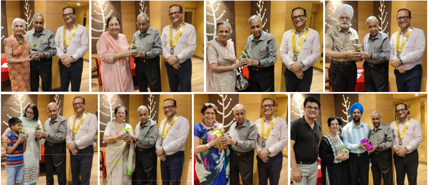
Mother's Day Celebration

Click here for live streaming on Facebook