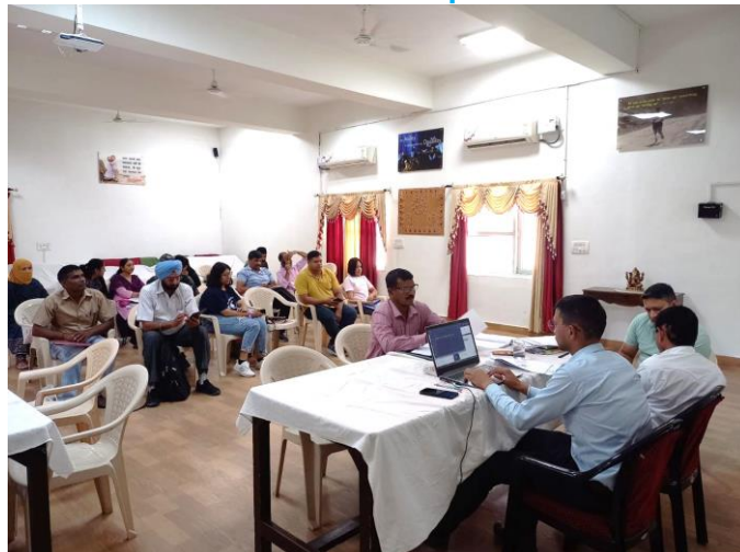
UDID Camp at Chandigarh Spinal rehab and Asha School Chandimandir