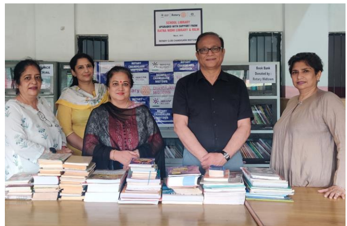
Padho Bharat Badho Bharat by Rotary Chandigarh Midtown by donating almirahs and library books to each library - GSSS 39, GSSS 20 and GSSS 35