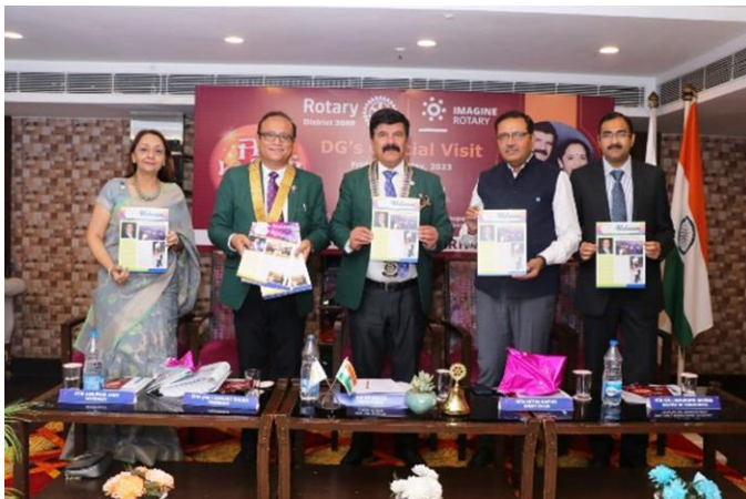
E-bulletin Udaan launched by DG VP Kalta