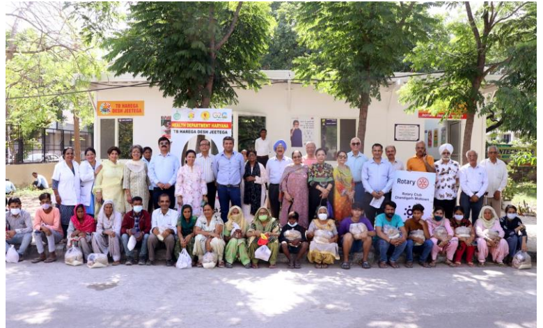
TB Hut at Civil Hospital, Panchkula