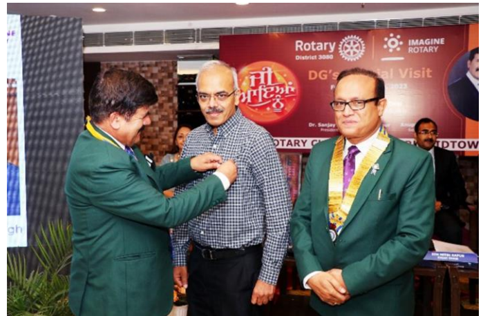
PHF recognitions by DG VP Kalta