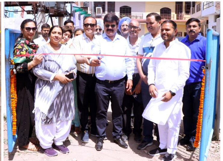
Rotary Adarsh Gaon, Village Bir Ghaggar