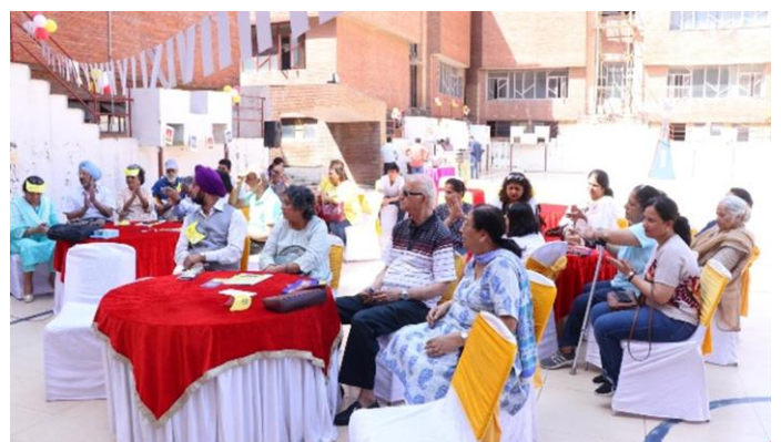
Colourful glimpses of the grand event