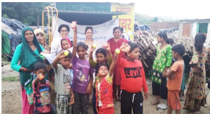
25 children in the age group 0-5 years were administered polio drops in Kaushalya Huts by ANM of the Pinjore block. Children were given play ball and biscuits by our club to encourage them to come forward for immunization for Polio Free World

Smart answer by a female passenger on a flight... A guy asked a beautiful lady sitting next to him... 'Nice perfume.....which one is it?... I want to give it to my wife...!!' Lady: 'Don't give her....some idiot will find an excuse to talk to her...!!' A letter from a teacher to a parent: Dear Parent, Edward doesn't smell nice in class. Please try to bathe him. Parent's answer: Dear Teacher, Edward is not a rose, Don't smell him, Teach him ..... Mother to Son: Who is Sultan Aziz? Son : Don't know Mother : Devote some time to pay attention to study also Son to Mother : Do you know Aunty Jennifer? Mother : Don't know Son: Sometimes pay attention to Daddy also