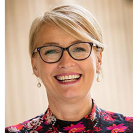
Sally Capp The Lord Mayor of Melbourne