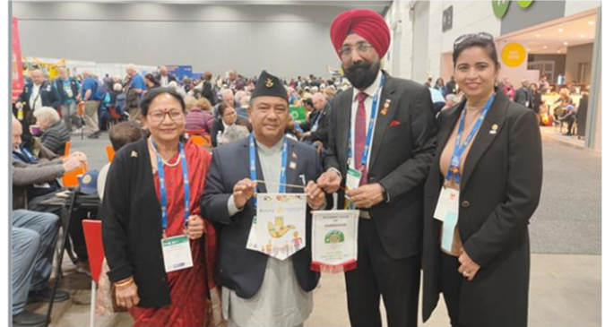
Exchange of Flag at House of Friendship