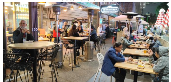
The Streets of Melbourne - South Wharf Dinner