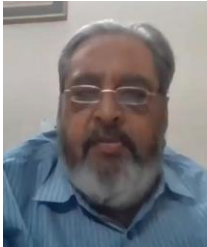
PP Dr VJS Vohra informed Sahyog presentation postponed to 28 July 2023