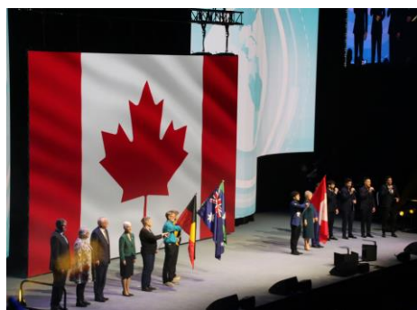
National Anthem of Canada