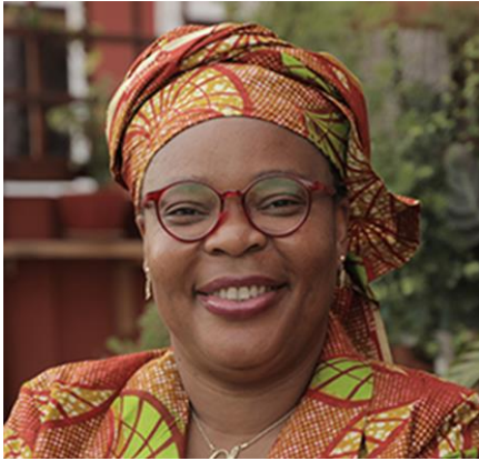
Leymah Gbowee 2011 Nobel Peace Laureate and Founder of Gbowee Peace Foundation Africa

Some prominent speakers in the convention;