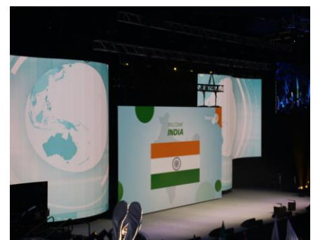
Flag of India