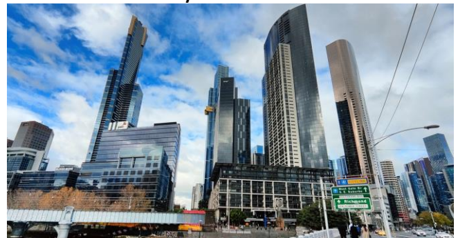
Visit to Eureka Tower