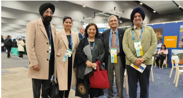
At House of Friendship