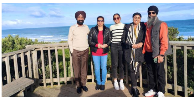
Trip to The Great Ocean Road