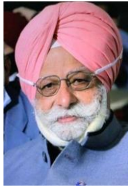
Meeting called to order by SAA PP RTPS Tulsi