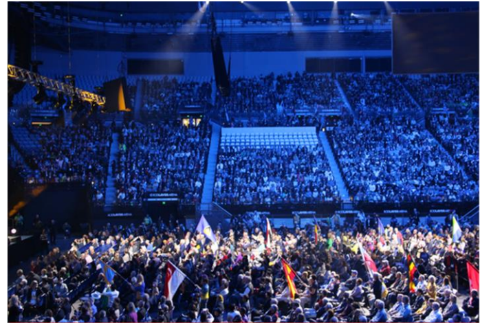
Melbourne RI Convention 2023

PP Amarjit Singh gave a wonderful presentation of the RI Convention. He explained that on the bank of river Yarra, Melbourne Convention and Exhibition centre was a beautiful and well equipped venue for RI Convention. Convention events are divided in four parts: