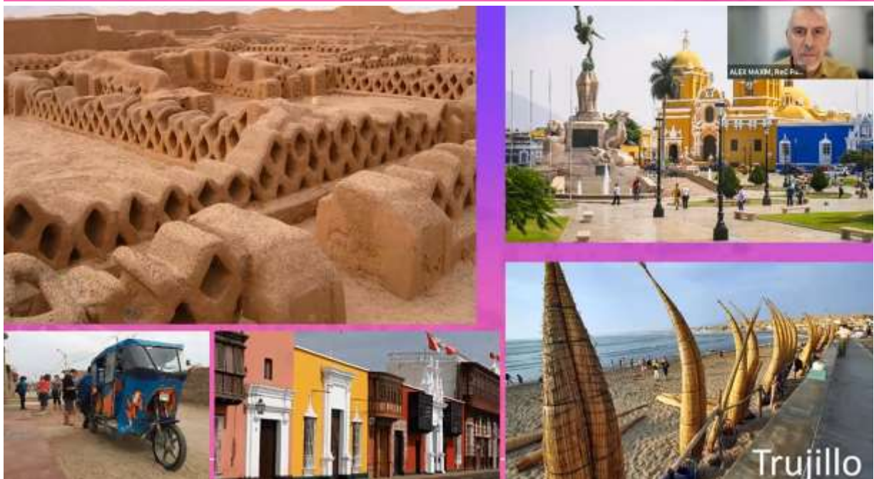
Colourful presentation from zoom platform by Rtn Alex Maxim