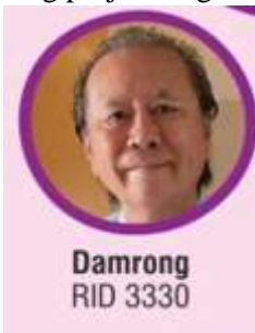
Damrong RID 3330

Rtn Alex from Peru and Rtn Isabel from Mexico of D 4465 shared a beautiful and vibrant presentation covering projects sightseeing food traditions etc.