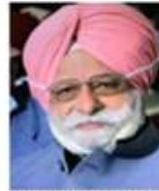
Meeting called to order by SAA PP RTPS Tulsj