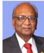
PP BL Ramsisaria club roster