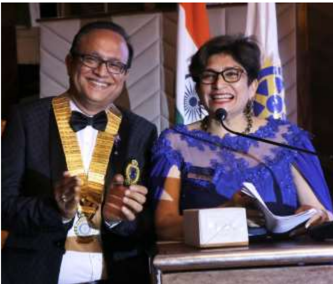
Happy family, after a vibrant and hectic Rotary year