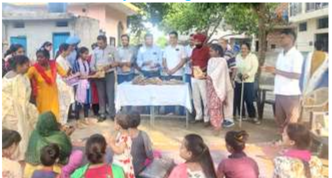
Under vocation services Avenue visited Maloya sewing centre where batch of 20 girls are undergoing 6 months training in Sewing & Tailoring