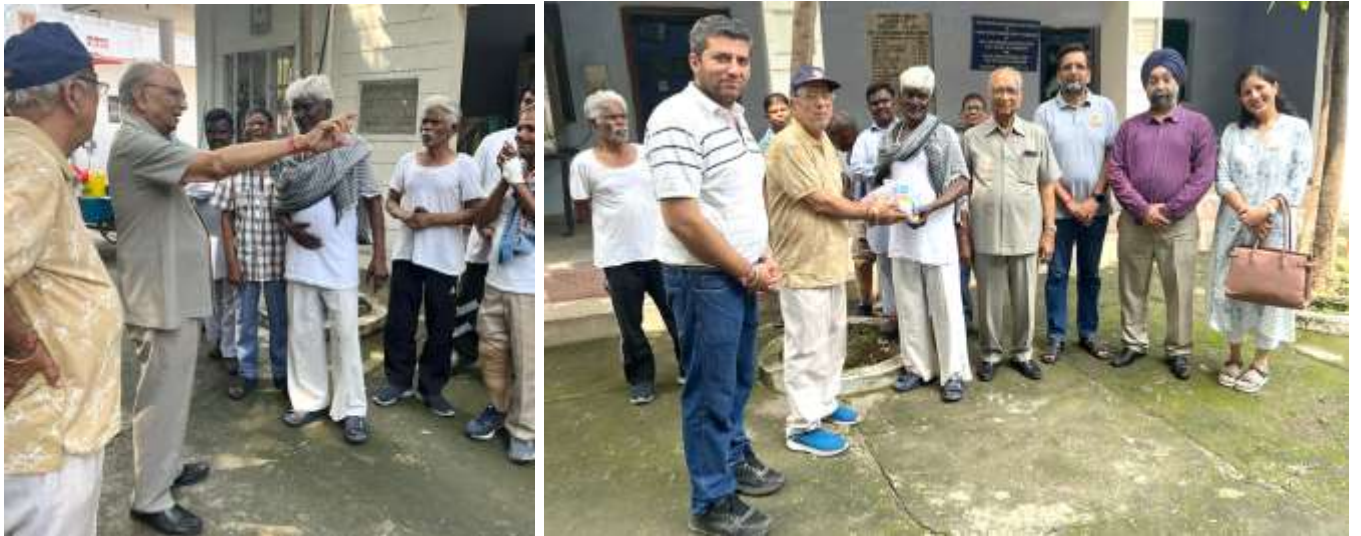
A visit was made to Kusht Ashram, our Signature Project to look into their requirements and felt the warmth the people there had for our Club