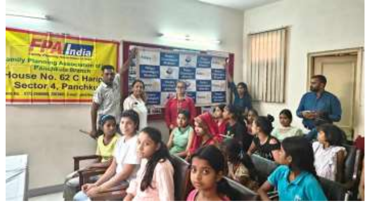
On 1st July 2023 visited Haripur Vocational Centre, where girls shared their experiences being benefited with the courses offered by Rotary