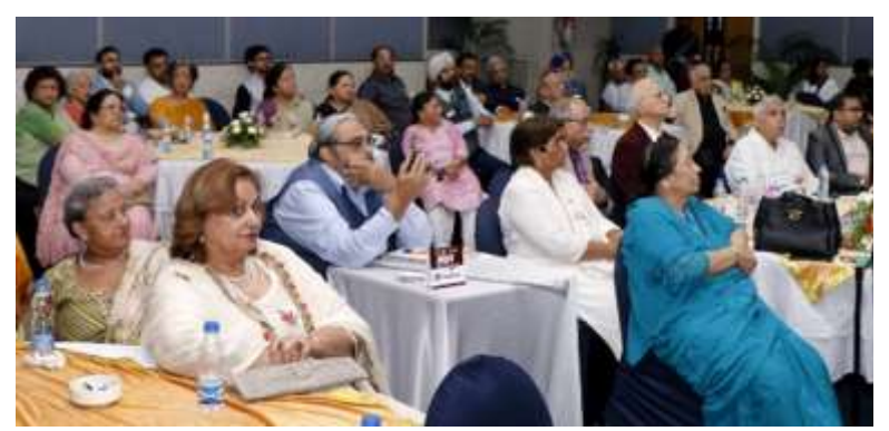
Large gathering for the Installation Ceremony at CII, Sector 31, Chandigarh