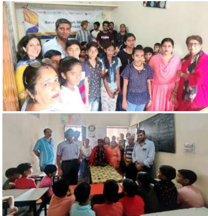
Installation of Interact at Anaameep Smart School, Halomajra the first installation of RY 2023-24