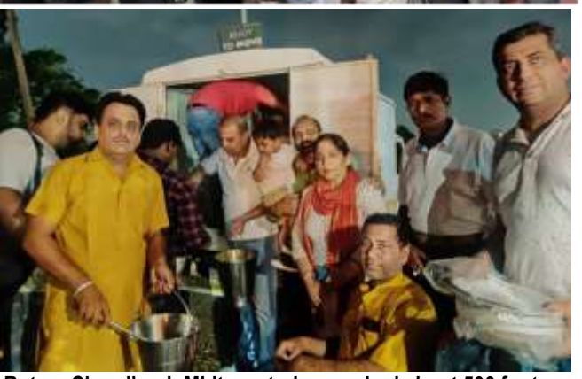
Rotary Chandigarh Midtown today reached about 500 for two consecutive days stuck up residents of Ekta Nagar and Shivalik Nagar, Zirakpur and supported them with Food