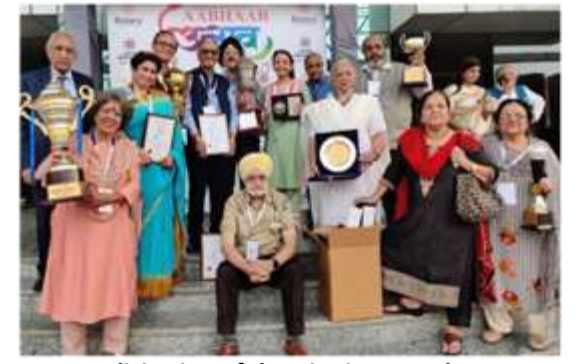
Installation Meeting 5th July 2023