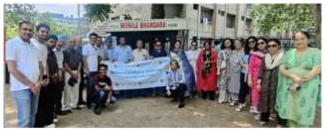
Annapurna Diwas. More than 500 People were fed with langar at Govt Hospital Sector 16 Chandigarh