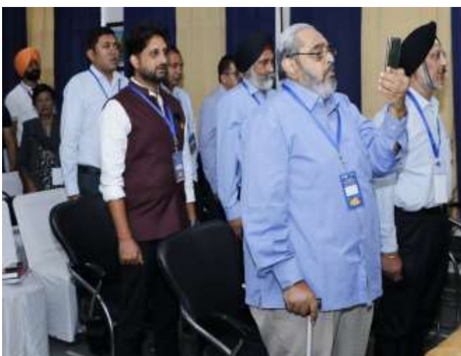
Glimpses of Seminar. For more photos on Facebook, click here