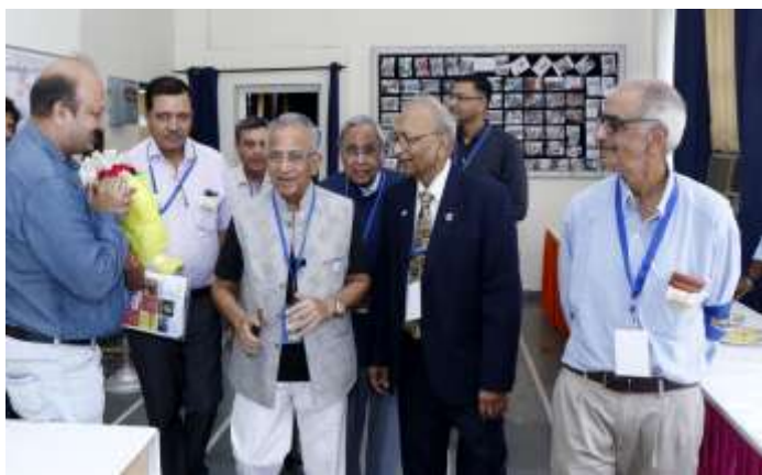
Glimpses of Seminar. For more photos on Facebook, click here