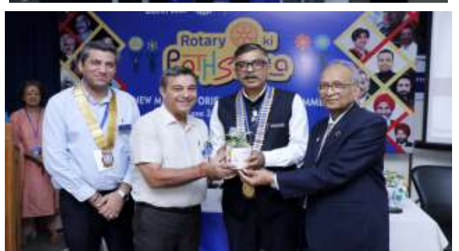
Felicitations and presentations. For more photos on Facebook, click here