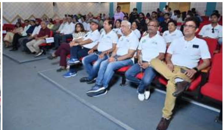
The event saw an incredible turnout of about 170 delegates