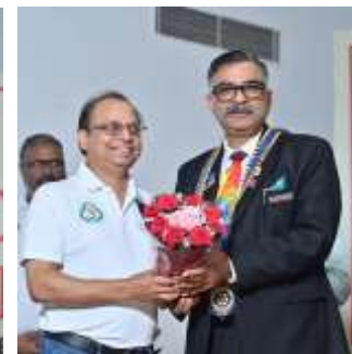
Felicitations by District Governor