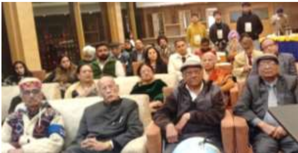
The audience – Rotarians, Anns and guests