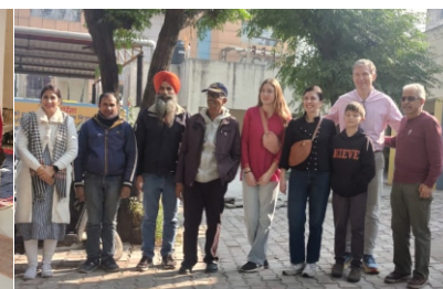
School Facility at Peermushala done with Global Partners - Twin City Club US