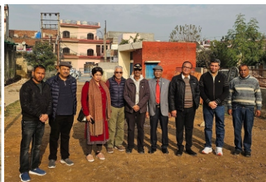
Rain Harvesting Facility at Bir Ghaggar done with Global Partners - Twin City Club US