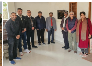
Anganwadi at Bir Ghaggar