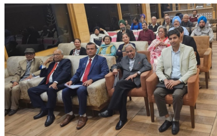
Weekly Meeting Rotary Club Chandigarh Midtown being held at Hotel Shivalik View with Guests from Rotary Karnal, Kenya, Mumbai and Bhopal