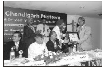
Club Charter changes hands