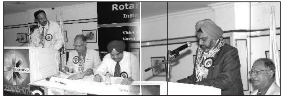
Outgoing President & Incoming President making their respective presentations