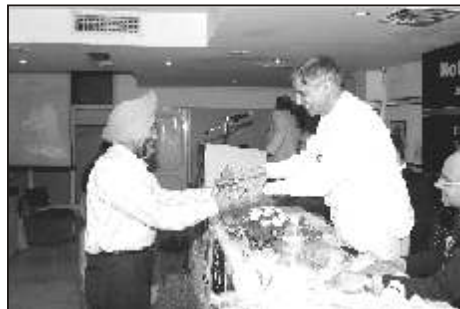
Wishing Happy B'day to each other !