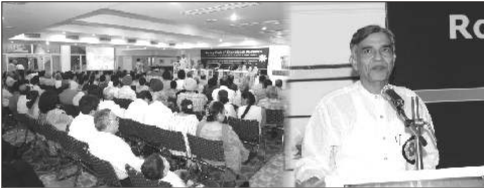
The audience giving a patient hearing to the Chief Guest