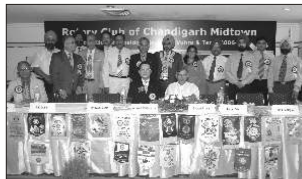
The Team to 'Lead The Way' in 2006-07