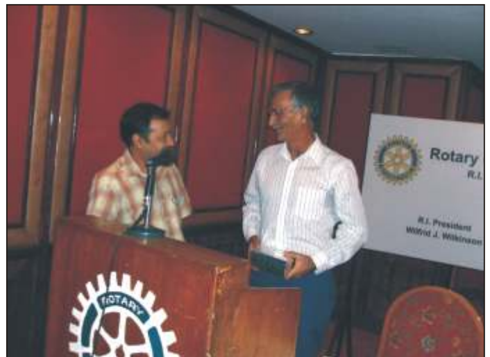
Memento for the Chief Guest