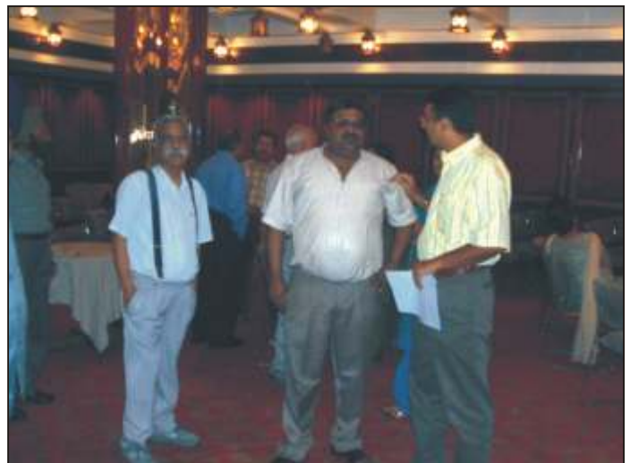
Before the Meeting was called to order