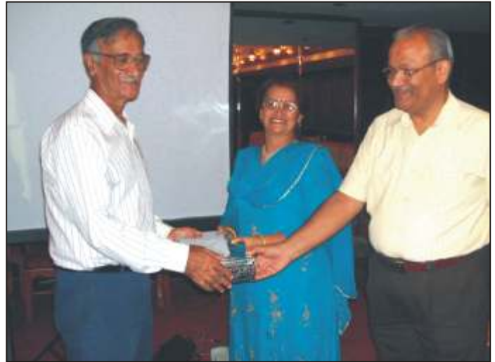
Wedding Anniversary, Many Happy Returns of the Day