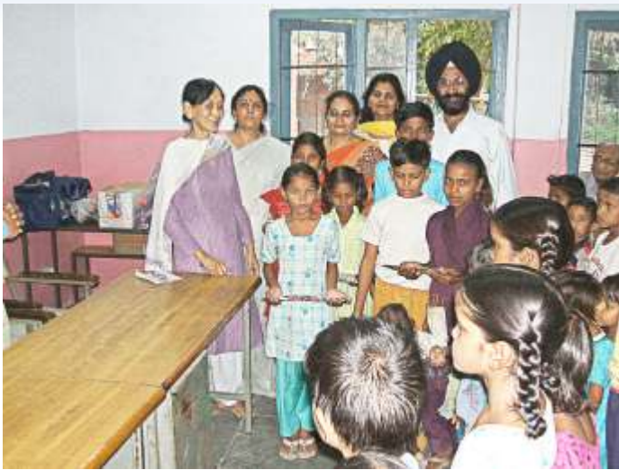
United we grow