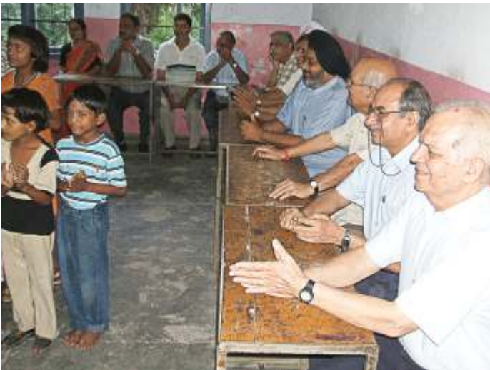
Rotarians keep it up