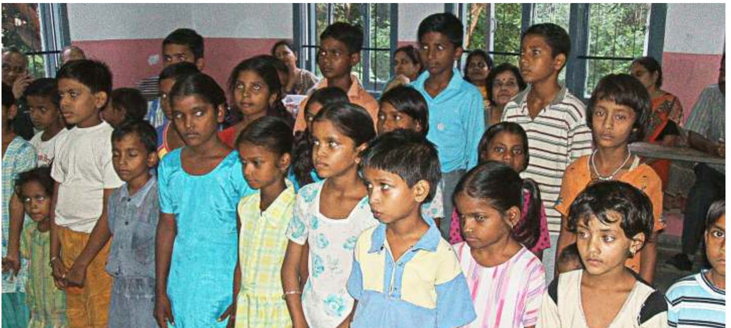
You have bright future