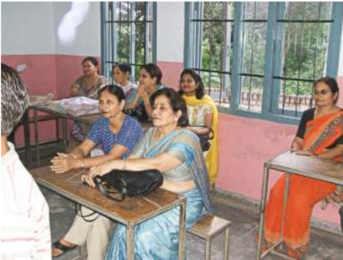
Annes are a big support

activities for children and taught them how to make bags, envelopes, cards etc. out of newspaper. This helped in creating more interest amongst the children.