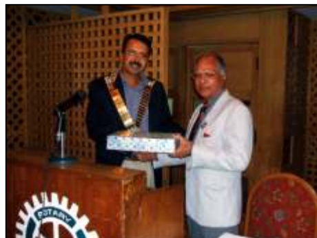
Memento for the Promoter