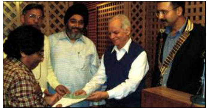
Certificate of Registration to Members RCC Panchkula