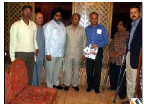
Members of the RCC with the Midtowners