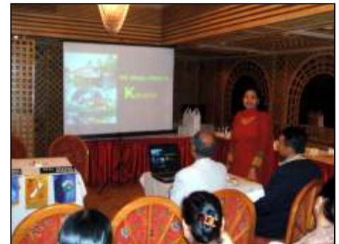
Promoters at Work