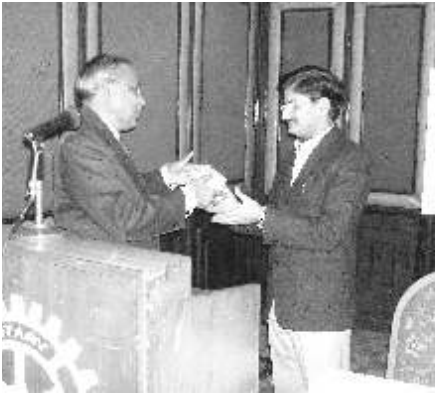
Memento for the Speaker