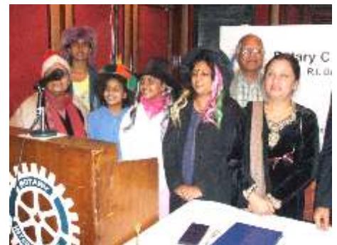
New Year Celebrations - Revelers

This is the last issue of the Mid Towner of 2007, and The Mid Towner wishes the readers, once again, A GR8 2008.