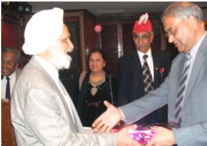
Best Fun-Loving Male