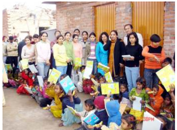
Children proudly displaying the gifts. The Staff & Rotaractors feel satisfied