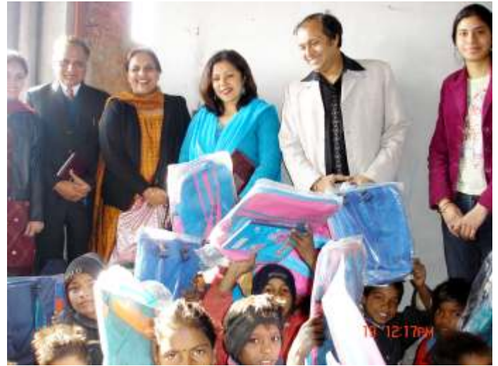
College Staff sorting the gifts.

distributed school bags and copies among these needy children. The next visit was to a school at Amb Saab colony near the railway line where more than 70 poor children are studying. After distributing copies and