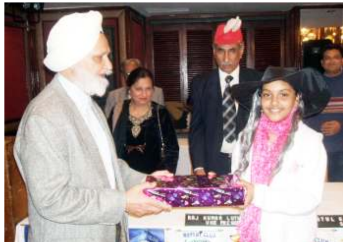
Best Fun-Loving Child