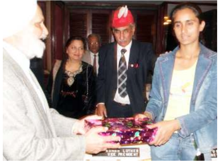
Best Fun-Loving Female

The music ended and the judges huddled into a corner for a session of discussions to nominate the best fun loving persons. Following were the deserving winners: