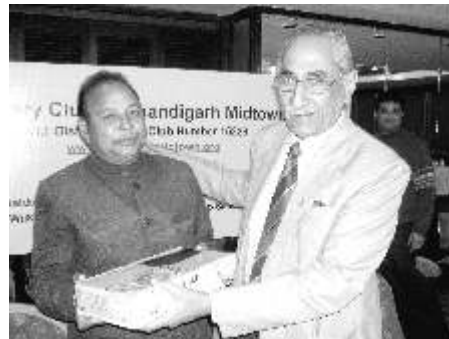
Memento for the Dy. Mayor