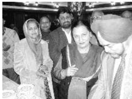
Cake for the Happy Birthday Boy