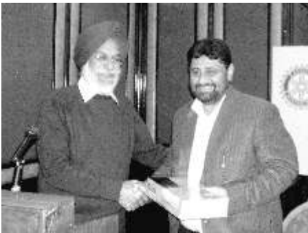
Memento for the Mayor