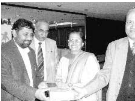
Gift for the Best fun loving Couple