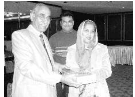
Memento for Mayor 2007