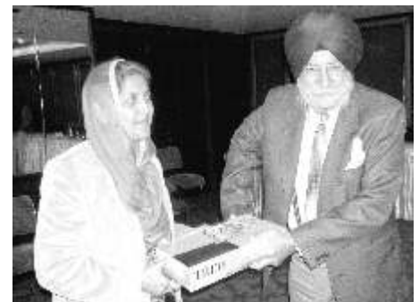
Gift for the Happy Birthday Boy