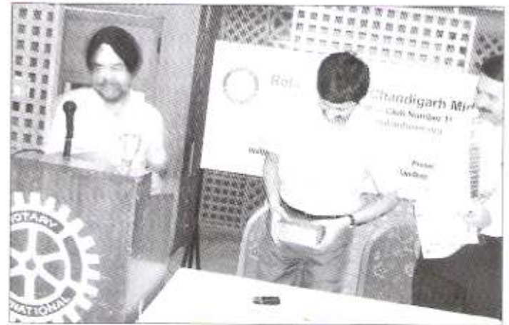
Vote of Thanks

making it costlier to drive in and near the City Center, and encourage car-pooling. Another way to reduce the congestion on the roads is to make the City cycle and pedestrian friendly, as the distances from the residential areas to the nearby markets are small. The learned speaker hoped the think tanks of Chandigarh and its