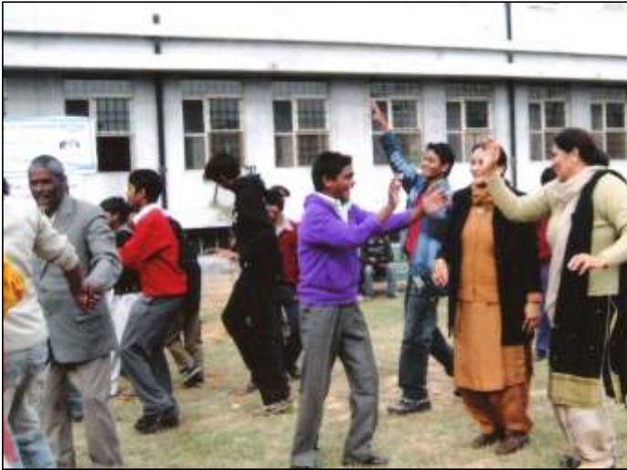
Celebrating Lohri at Pinglewara - Palsora

InnerWheel Club Chandigarh Midtown celebrated the winter festival of Lohri with the inmates of Pinglewara in village Palsora on 12 Jan 2008.