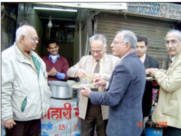
Microloan Project - Savoring Pranthas

2. The next appointment of the DG was with the President, Secretary, Treasurer, President Elect and Secretary Elect. They met over lunch at The Golf Club and the Governor went through the documentation put before him. The DG emphasized the need to meet the membership growth target as well as the target of each Rotarian each year 100 dollars. He went through the PHF contributors list and was happy to see that most of our members were PHF's but emphasized the need to motivate members to contribute towards multiple Paul Harris Fellows.