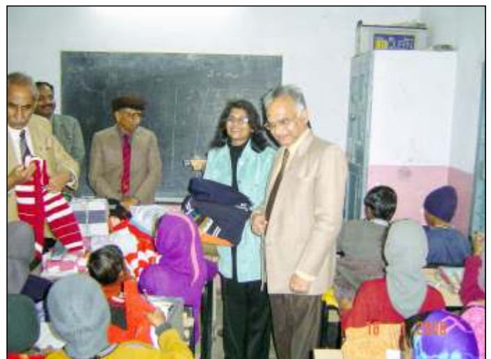
Night School, Sarangpur