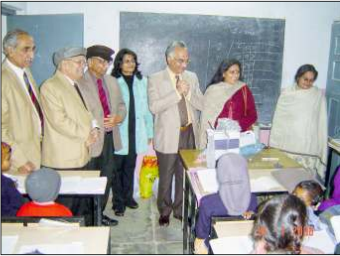
Visit to Night School, Sarangpur