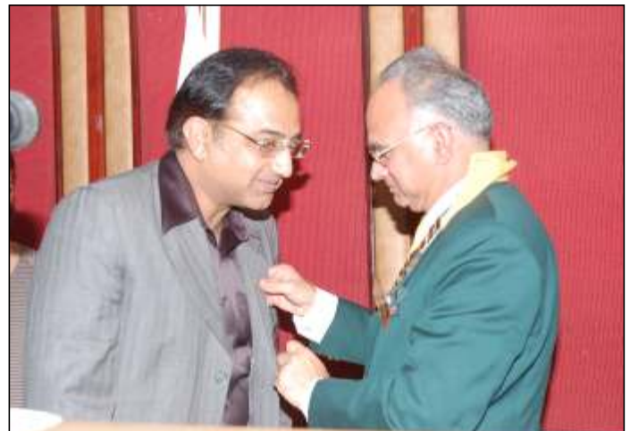
Happy to join the happy family of Midtowners