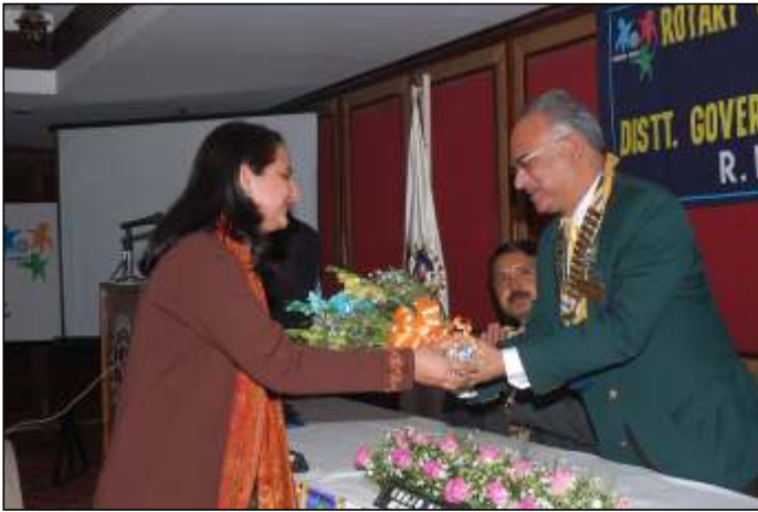
Flowery welcome to the Distt. Governor

club's existence to have a Chandigarh Midtowner officially visiting us as the District Governor! It was a proud & happy moment for all the Chandigarh Midtowners.