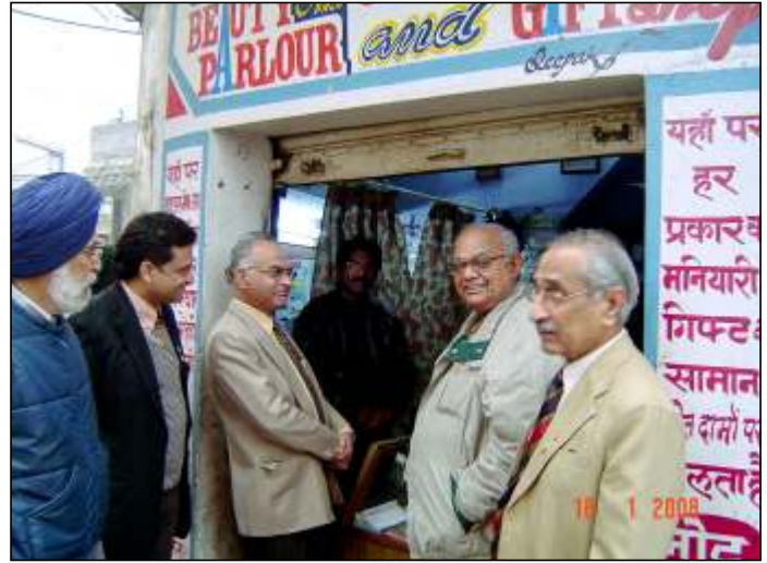
Microloan Project - Beauti Parlour in Village Maloya

3. The DG was then taken to the Sewing & Embroidery vocational center being run at village Khudda Ali Sher. He interacted with the batch, which had just passed out as well as the girls under training currently. He had a look at their work and also took time to see the method of imparting instructions. The village youth club members had also joined in to welcome the DG.