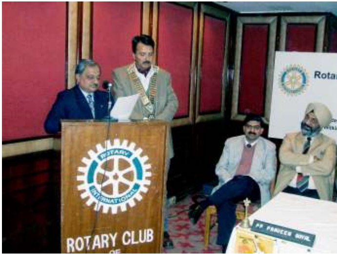
Quiz Masters and the Rotary Central Team