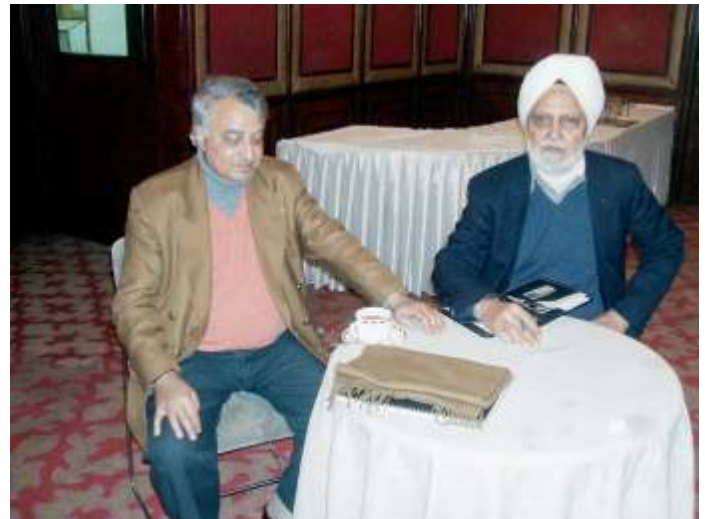
Micro Loan Projects - Fond Memories