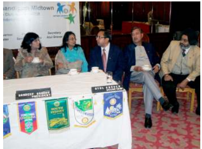
The participating Teams