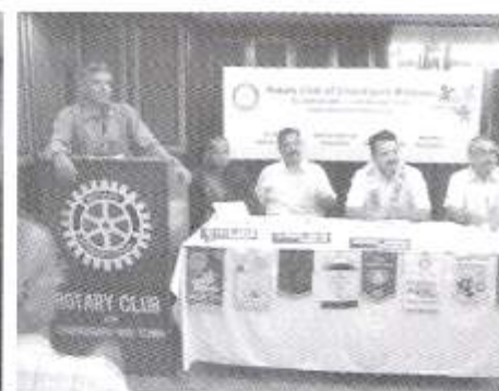
Pallav introduces the Panelist