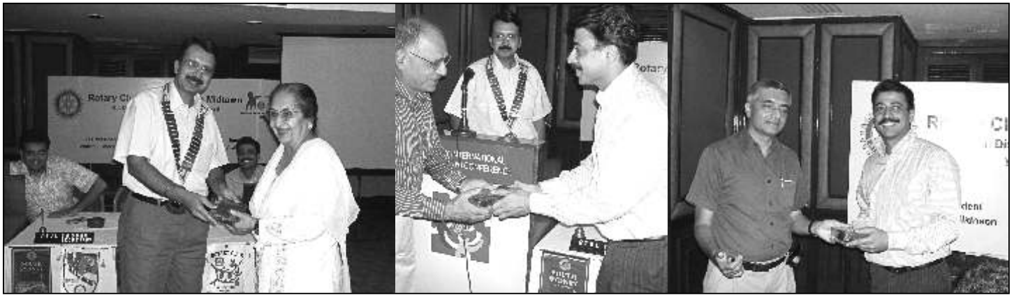
Gift for the Punctuality Draw Winner