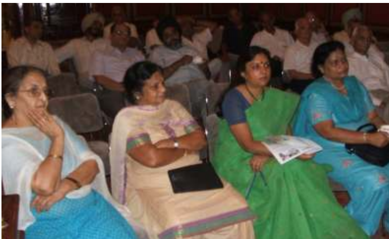
The Rotarians say 'Pass Pass Pass' to the Budget