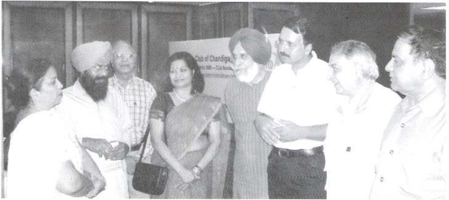
Meeting the beneficiaries