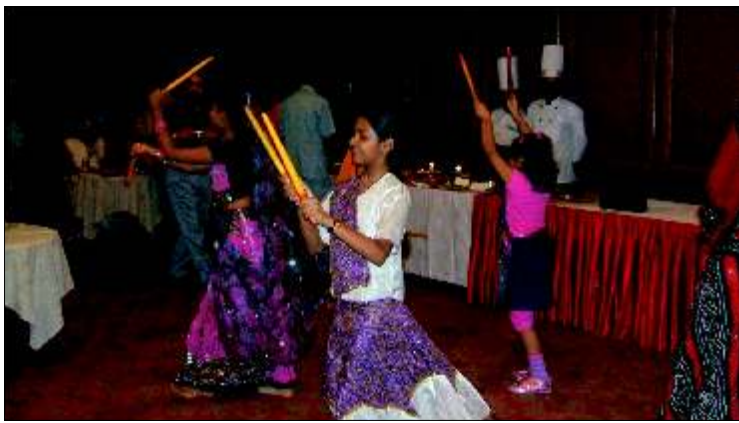
Children Performing Dandiya