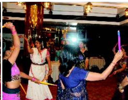
Anns & Ladies dance with full enthusiasm - the true spirit of Dandiya