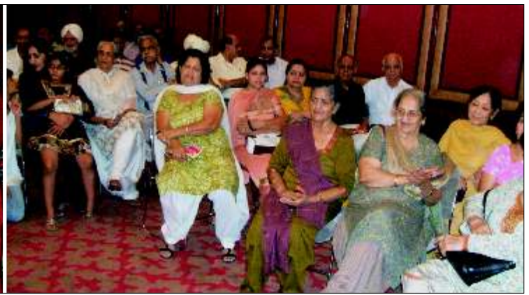
The Enthralled Audience

occasion than the elders, as their dresses were traditional.