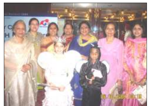
The Winners with their Parents, Judges & the President