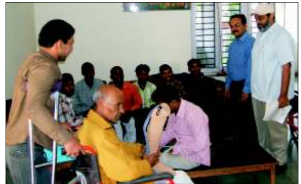
Inmates of Cheshire Home were also given artificial limbs and assistive devices