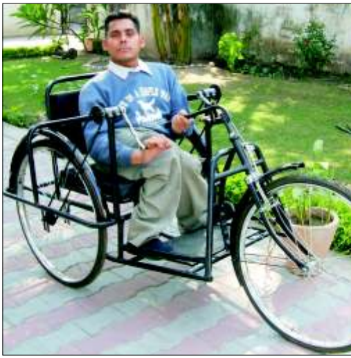
Hanuman is happy to get a tricycle