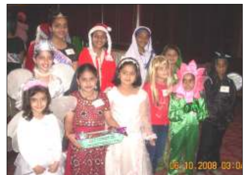
All the participants for the Fancy Dress Competition