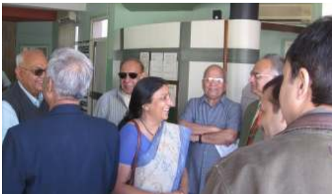
President & other members at the camp

A total of 135 patients were examined. Basic laboratory investigations were done free of cost and X-rays(where required), were done at subsidized rates. Free medicines were provided. Wherever surgery is required, the same will be done at subsidized rates.