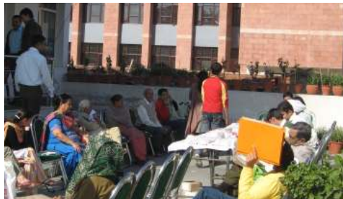
Patients awaiting their turn