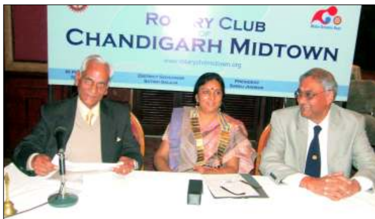
All smiles before the announcement of B.o.D. 2009-10