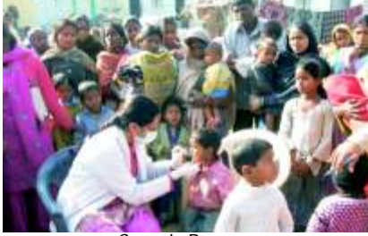
Camp in Progress